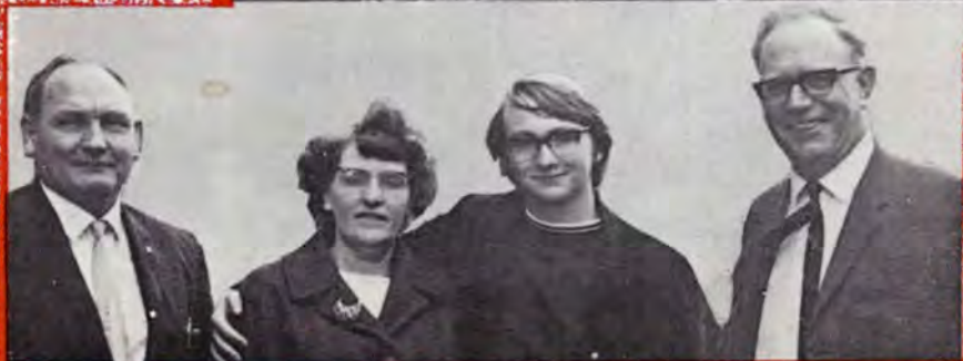
THE PRIZEWINNERS (See page 141)